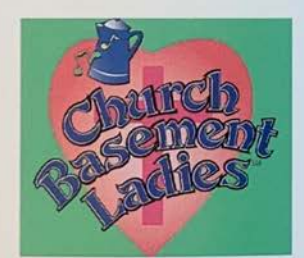
August 14 - 25

All Shows Subject to Availability of Rights