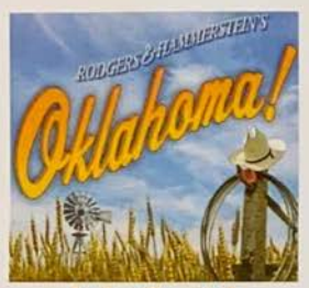
July 3 - 14