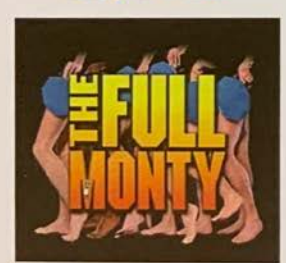
July 31 - August 11