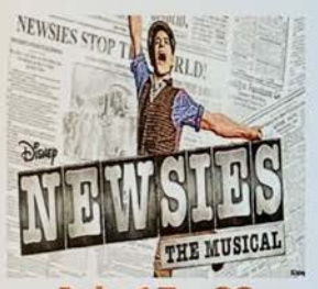
July 17 - 28