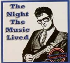
June 5 - 16