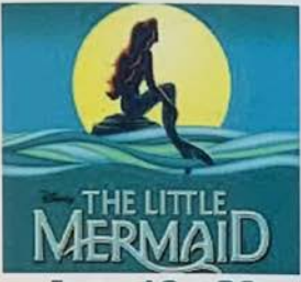
June 19 - 30